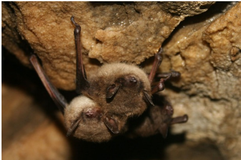
Little Brown Bats