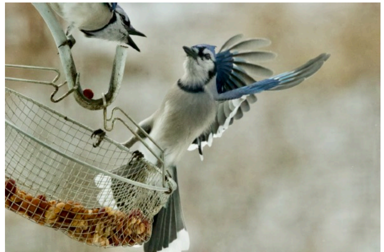
Blue Jays at the feeder