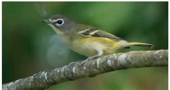
Blue-headed Vireo.