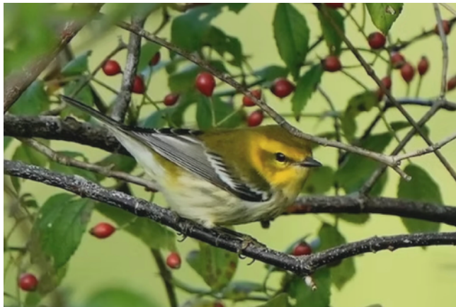
Black-throated Green Warbler

In late September, a state birding event, The Big Sit, was hosted by the Illinois Audubon Society. The event is very similar to a Global Big Day; a competition in which bird watchers count as many species as possible in a 24-hour period. While Global Big Day involves moving from place to place to maximize the number of species spotted, The Big Sit competition is exactly as it sounds and stays in one place.